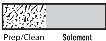
The Solement Advantage